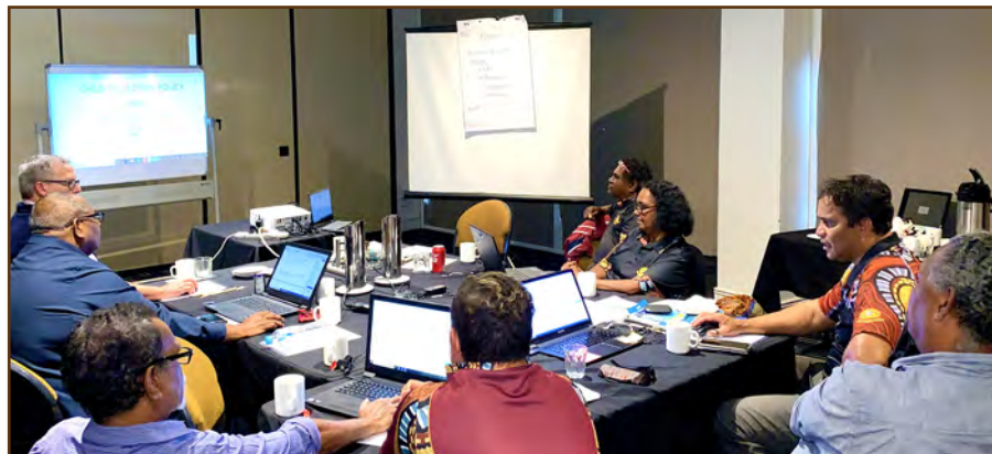
YASC Councillors & staff at a two-day workshop reviewing policies (statutory & regulatory) as per the Local Government Act

"The dashboard should be operational by early April 2020."