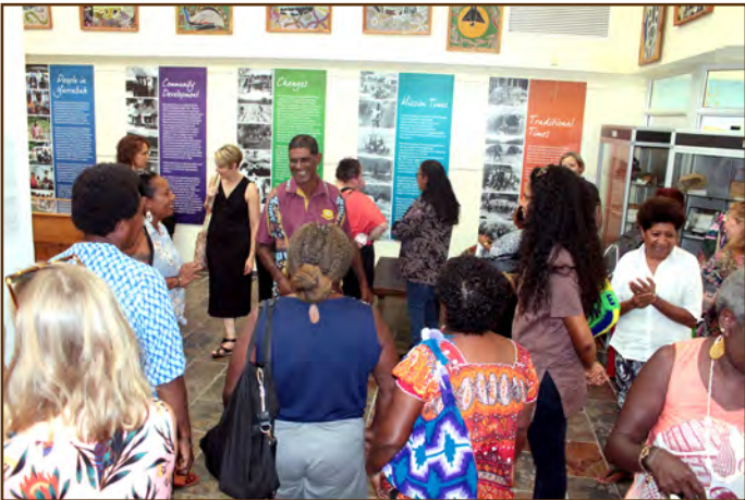
My wish is to work with people who inspire me but I also want to inspire the people I work with. The Arts Precinct is a vibrant place, has a lot to offer and we are calling and inviting any Yarabah residents interested in the arts to join us. PICTURED ABOVE: a delegation of Papua New Guinean and Indigenous Australian entrepreneurs - all women - visited the Precinct as an early International Women's Day event